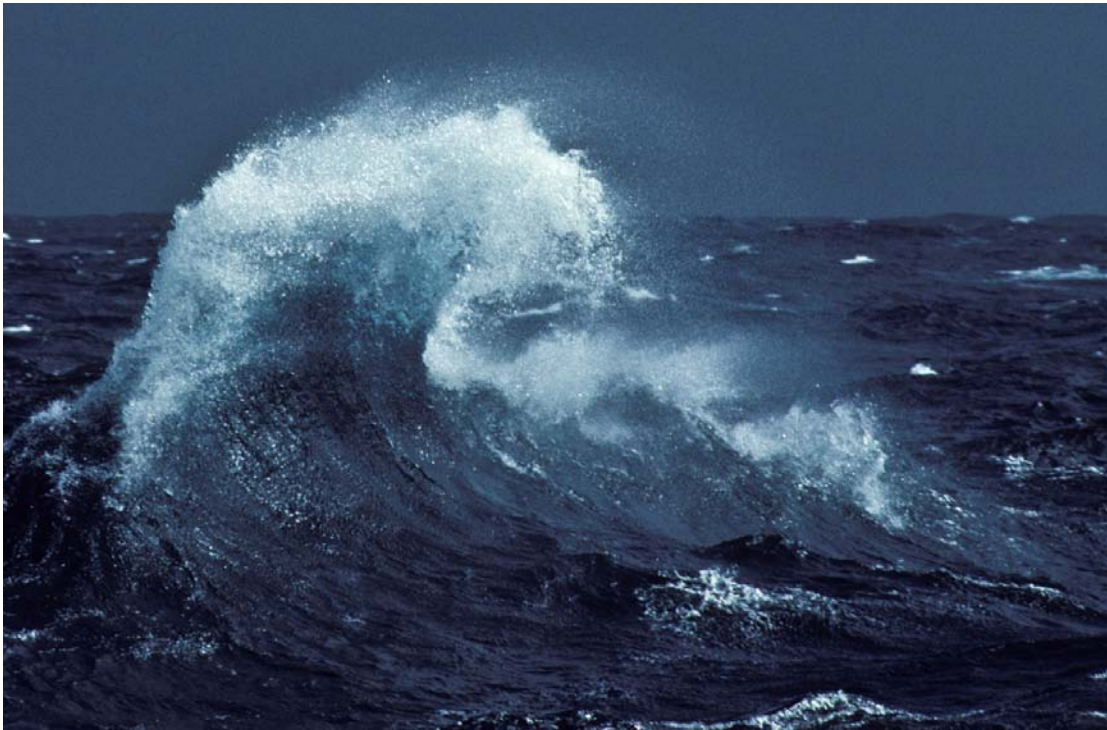
Figure 1 (a) The Great Wave off Kanagawa (Kanagawa-oki nami-ura) woodcut by Katsushika Hokusai. (b) Photograph of a breaking wave in the sub-Antarctic waters of the Southern Ocean taken from the French research vessel Astrolabe during one of its regular voyages between Hobart and the Dumont d'Urville Station in Adélie Land (V. Sarano, 1991). Note the transverse and longitudinal localization of the wave that is remarkably similar to that depicted by Hokusai.